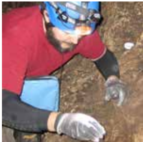
A biologist collects cave soil for the analysis of subterranean fungi, including Pseudogymnoascus destructans, the pathogen that causes WNS in bats.

To further DoD's mission of investing in bat management while facing the threat of white-nose syndrome (WNS), the DoD Legacy Resource Management Program (Legacy) funded a novel research study (Legacy Project 14-766) at Fort Hood in central Texas to investigate and develop early detection protocols through environmental sampling for Pseudogymnoascus destructans ( Pd ), the pathogenic fungus that causes WNS in affected bats. Likely introduced from Eurasia, this cryophilic (cold loving) fungus has caused the death of millions of bats since it was identified in upstate New York in 2006. Since its discovery, Pd and WNS have spread rapidly across North America, with reports in 32 states and 5 Canadian provinces as of July, 2016. Recently, new records of Pd have occurred in Oklahoma and Arkansas. Continued Pd expansion puts a focus on the protection of resources in adjacent states, such as Texas, that are on the threshold of the disease. Due to potential migratory connections to neighboring, affected regions, infected bats could eventually introduce the disease to healthy bats living in or migrating to unaffected areas.