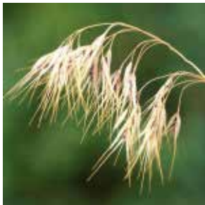
CG.