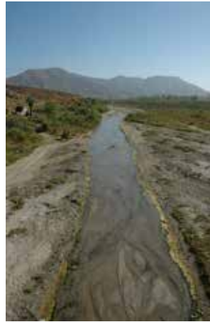
Survey site at San Vicente, Baja California, Mexico.

Survey site at Las Palmas, Baja California, Mexico.