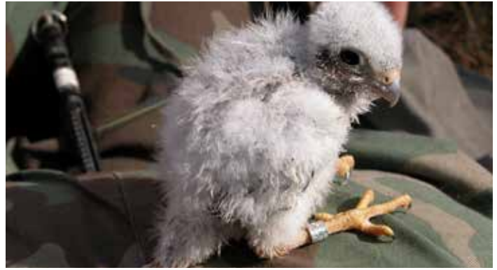
Kestrel chick, a species that nests in enlarged RCW cavities.

and because they also support a significant amount of other wildlife, the RCW is considered an umbrella species. It is also an “indicator species” for healthy, older-growth, fire-maintained longleaf pine ecosystems.