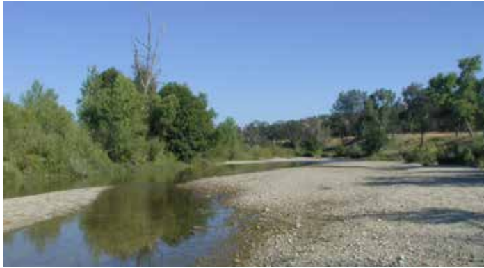
San Antonio Creek located at Fort Hunter Liggett, California.

The senior author has worked extensively with this species. It should not be surprising that the military installations listed above contain some of the finest riparian habitats in the entire region, and arguably the densest populations of arroyo toads anywhere within their range. Somewhat surprisingly, in the less-densely populated rivers of Northern Baja California, the threats to the species are and have been largely the same. Arroyo toads face identical threats and challenges in Mexico.