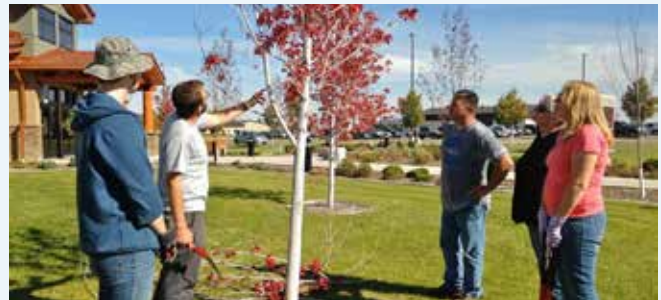
Volunteers participate in a tree-pruning class at Malmstrom AFB, Montana during the two-day NPLD celebration in 2015.

To learn more about NEEF and NPLD, to see how DoD is involved, or to find a site near you, visit https://www.neefusa.org/public-lands-day . Maybe next year, you too can host or volunteer for an event!