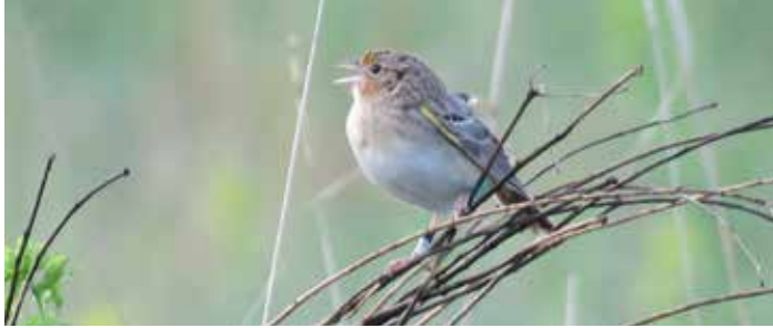
A grasshopper sparrow wearing color bands (black over aluminum on the right, green over green on the left) and a light-level geolocator (clear stalk visible on the bird's back) at Camp Grafton, North Dakota.

populations have declined an estimated 50-80 percent over the last 50 years. In the face of alarming losses of habitat elsewhere, DoD lands are increasingly vital for these species.