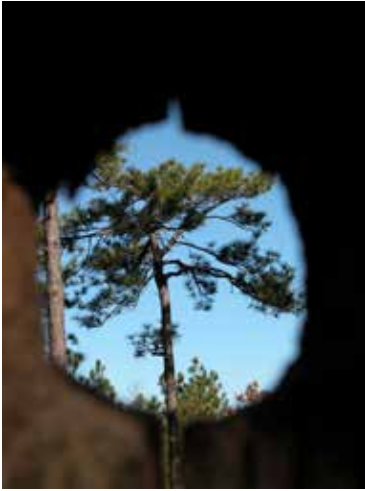
Bird's eye view of longleaf pine, from inside RCW cavity.

Longleaf pine forests continued to disappear as a result of timber and pine resin harvesting, urbanization, agriculture, and species conversion. Fire suppression stopped forest generation and created dense pine/hardwood forests, which are not high quality RCW forage, and changed species composition. As virgin pine forests disappeared (only 2-3 percent remains), RCWs declined. The species was listed as endangered under the United States List of Endangered Native Fish and Wildlife , in October 1970,