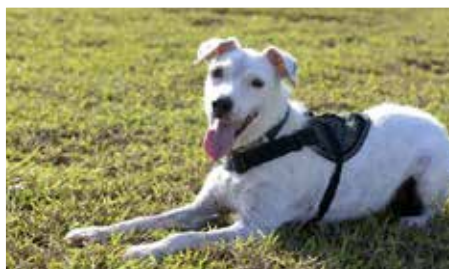
Striker, a USDA brown tree snake detector dog.