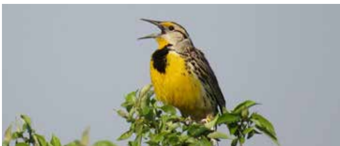
A color-banded eastern meadowlark at Konza Prairie, Kansas carries a GPS tag on its lower back (antenna visible behind the bird's left foot).

Through the Legacy funded project, Migration Ecology and Connectivity of At-Risk Grassland Birds , VCE biologists are tracking the migration routes and wintering areas of these three grassland bird species for the first time. Researchers are using sophisticated light-recording tags, Global Positioning System (GPS) data loggers, and solar-powered satellite tags to record precise location data for birds to help natural resources managers understand the entire annual cycle of migratory birds across their breeding range. The VCE teams deployed tags on breeding birds during the summers of 2015 and 2016 at seven DoD installations across the species' breeding ranges: Camp Grafton, North Dakota; Camp Ripley, Minnesota; Fort McCoy, Wisconsin; Fort Riley, Kansas; Joint Base Cape Cod, Massachusetts; Westover Air Reserve Base, Massachusetts; and Naval Air Station Patuxent River, Maryland. Once the birds leave these installations, VCE's tracking devices allow biologists to determine where and when these migrants travel, and what lands they use until the next breeding season.