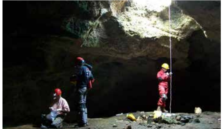
Researchers collecting samples and recording data in a cave at Fort Hood, Texas.

bats exhibit WNS symptoms will allow DoD natural resources managers to implement monitoring programs and prevention measures to advance DoD's goals described in the National Plan for Assisting States, Federal Agencies, and Tribes in Managing White-Nose Syndrome in Bats . Studies like DoD's effort at Fort Hood are crucial for contributing to the understanding of this emerging and ecologically damaging disease while filling regional information gaps on the poorly understood nature of subterranean fungal communities.