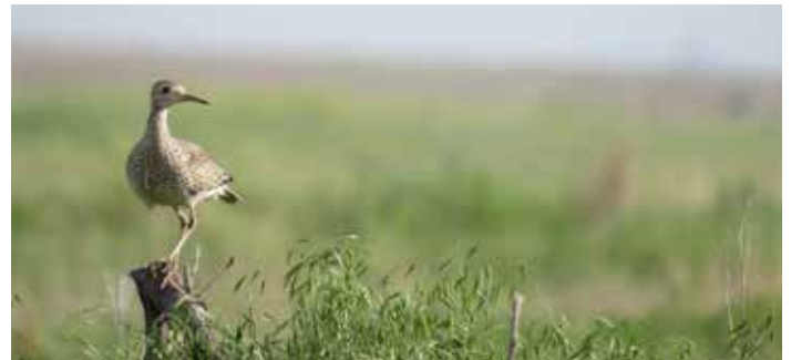
An upland sandpiper surveys its territory at Fort Riley, Kansas.

VCE's work has the potential to link management and conservation actions across DoD installations and migratory bird routes in other regions to reduce risks and ensure the safety of military pilots while helping imperiled grassland birds.