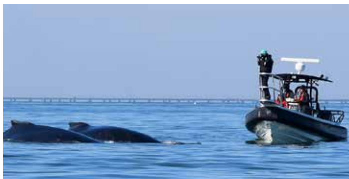
Two humpback whales being photographed by researchers from HDR Inc. off the coast of Virginia Beach, Virginia. Chesapeake Bay Bridge-tunnel in the background.

The U.S. Navy’s mission is to operate at sea 24 hours a day, seven days a week, providing security for our nation and allies. While conducting that mission, the Navy also has a responsibility to serve as a good steward of the environment. The Navy demonstrates that commitment by complying with environmental laws, and investing in programs that minimize the effects of our activities on the environment. Federal environmental laws and regulations that apply to marine mammals and other protected marine species include the Endangered Species Act and the Marine Mammal Protection Act . To comply with these Acts, the Navy’s training and testing commands conduct mitigation and monitoring to understand and minimize the potential for our actions to affect marine species.