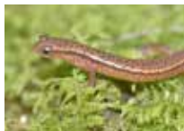
Blue Ridge Two-lined Salamander (Eurycea wilderae).

The National Genomics Center for Wildlife & Fish Conservation published their final protocol for environmental DNA (eDNA) sampling of aquatic organisms in streams. eDNA is DNA that a species has released into the air, water, or soil. Sampling for eDNA is a faster and less expensive approach for detecting a species' life stage, disease status, reproductive status, diet, habitat structure, and density than traditional methods. However, sampling for eDNA is a difficult process that requires scientists to follow strict protocols to avoid sample contamination. The final report provides a sampling protocol designed for detecting fish in streams. Researchers