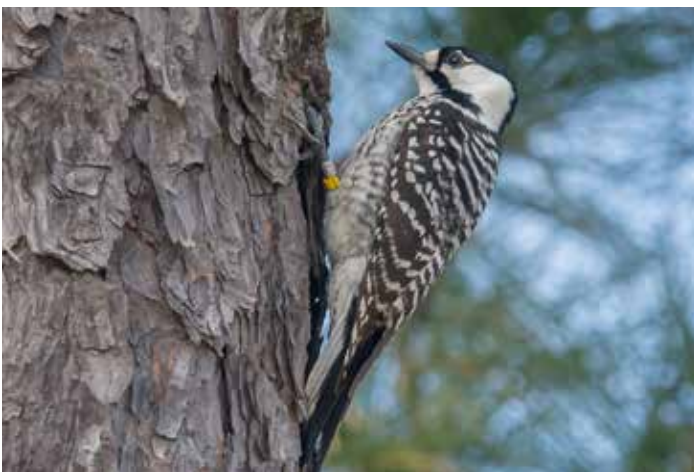
RCW on a longleaf pine.

DoD has played a substantial role in the recovery effort for RCWs since the species currently occurs on 14 installations (9 Army, 4 Air Force, and Marine Corps Base Camp Lejeune). The U.S. Fish and Wildlife Service's (USFWS's) 2003 RCW Recovery Plan identified 39 designated recovery populations that included 12 primary core populations requiring 350 pbgs, and one with 1000 pbgs; 10 support core populations (250 pbgs), and 16 essential support populations (25-100 pbgs). Out of these, DoD is responsible for four primary and eight essential support populations. USFWS's RCW Recovery Plan set a goal to down-list the RCW to threatened by 2050, with de-listing planned for 2075.