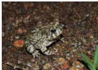
Arroyo Toad.

almost exclusively in coastal streams and rivers of California and Baja California, Mexico, with a few populations in Mojave Desert drainages of the San Gabriel and San Bernardino Mountains. It grows to 5–8 cm in length (not including the length of the tail), is olive green or gray to light brown in coloration, and has dark spots and small warts. A prominent white “v-shaped” stripe crosses the top of the head between the eyes. This species is a member of the “ microscaphus ” complex of toads, and one of three species in this complex of disjunct southwestern toad species including the Arizona toad ( Anaxyrus microscaphus : Arizona and New Mexico) and the Mexican Toad ( Anaxyrus mexicanus : Northwestern Mexico). The arroyo toad occurs on Army, Navy, and Marine Corps installations in California.