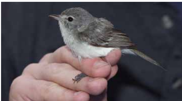
LBVI on Naval Weapons Station Seal Beach Detachment Fallbrook in north San Diego County, California.

Prado Reservoir southeast of Los Angeles to establish field sites for riparian habitat rehabilitation that would benefit LBVI and other riparian species. USACE has proactively managed habitat for LBVI at Prado and currently has more than 400 nesting pairs in the basin. I also was at Marine Corps Base Camp Pendleton earlier in the summer, where management for LBVI along the Santa Margarita River is providing another stronghold for the species. With such robust localized populations of the vireo, is it possible to achieve rangewide recovery? How can DoD work cooperatively with USACE, and with other federal agencies, to help recover listed species? These are questions of great interest to many, and the focus of a new effort within USACE.