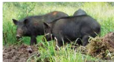
Feral Swine.

Most people outside of the southeastern U.S. tend to chuckle when they hear the term "wild pig." Perhaps this is because the term is foreign to them. Perhaps they have never encountered a 200-pound boar in nature. This is unfortunately not the case for many of those near DoD installations across the southeastern U.S.