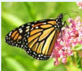
Monarch Butterfly.

National Public Lands Day (NPLD) is a program coordinated by the National Environmental Education Foundation (NEEF), and is the nation’s largest single-day volunteer effort to benefit public lands. For the last 23 years, NPLD has brought together thousands of volunteers to help restore the country’s public lands. In 1999, DoD joined NEEF and the NPLD partnership and, for the past 17 years, has funded 360 projects through the Legacy Resource Management Program (Legacy). Of the 360 Legacy-funded projects, 214 of them focused on pollinators. Each year, DoD installations can request up to $6,500 per project for materials, equipment, and supplies to implement NPLD efforts at military installations. In 2015, approximately 200,000 volunteers worked at over 2,500 sites across the nation. Some of the projects this year and in previous years provided benefits for monarch butterflies.