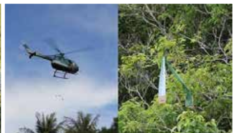
Aerial application of BTS bait.